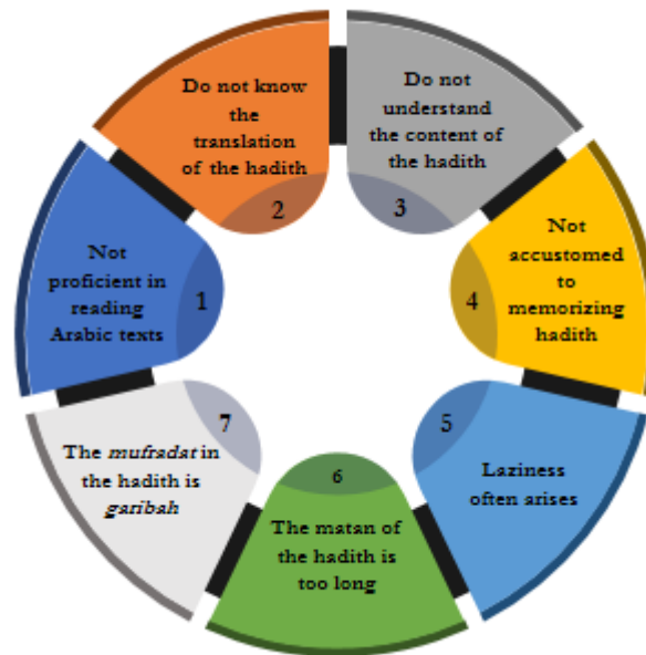
Fig 2. Students' difficulties in memorizing hadith

Research and issues related to the aspects of difficulty in memorizing hadith have been widely studied in the world of education, especially in the process of learning the Quran and Hadith. However, previous studies only focused on pre-college students, namely early childhood education, elementary schools, junior high schools, high schools, and boarding schools. For example, the results of research on the application of the movement method for memorizing hadith in children or learning to memorize hadith using the Kauny method, the application of gamification of memorizing the Quran and android-based hadith using the scott method, the development of animated video media for the ability to memorize hadith in early childhood, the transmission and transformation of memorizing the Quran and Hadith at the Al-Aqobah Islamic boarding school, improving the ability to memorize hadith in students with lafdhiyah translation (Fathurrobbani, 2021).